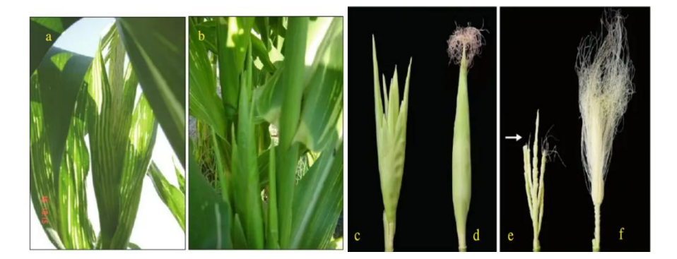
Fig. 2. Boron deficiency symptom of maize (cv. NS72) grown in sand culture without added B at anthesis showing: white stripes or transparent streaks on leaf lamina (a), multiple ears (b, c) and short silks (e: arrow, removed husk) compared with normal ear of B20 (d, f : ear after removal of husk) Lordkaew et al. [62]

There are some symptoms through which B deficiency can be identified in crop plants. Like interruption of flowering and fruiting [59] and reduced yields, with discolored or deformed fruit or grain [60]. Deficiency symptoms are also different among species. 'Hollow Heart' symptom (empty seeds) can be seen in soybean ( Glycine max L.) or groundnut ( Arachis hypogaea L.) in black gram( Vigna mungo L.) symptoms are not visible in seeds but reduction of grain yield can be upto 50% [61].