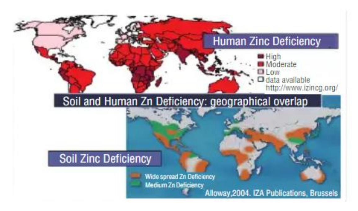
Fig. 1. Geographical overlap for soil and human Zn deficiency

"Plant emergence, stand establishment, further growth and yield can be improved by seed primina with Zn. Germination and field and emergence increased by 38 41%. respectively in when seeds were primed with 0.05% ZnSO<sub>4</sub> solution" [35]. "Zn-seed priming also improved yield and related traits of common bean (Phaseolus vulgaris L.)" [36]. Kaya found that in Barley (Hordeum vulgare L.) germination and seedling development can be improved by Zn-seed priming [36]. "During seed development Zinc content in newly developed radicles and coleoptiles are higher, which indicates that Zinc is involved in early seedling development, their physiological processes and possibly protein synthesis, cell elongation, various membrane function and resistance to abiotic stresses" [37]. "Higher Zinc content in seed might be helpful in protection of soil-borne pathogens during germination and seed development stage which in turn ensures a good crop stand" [2] and a better yield. Dry matter accumulation, enhanced mineral uptake, better water uses efficiency (44%) in drought stressed barley was achieved by seed priming [38]. Ullah et al. [39] reported that when seeds were soaked in 0.5 M ZnSO<sub>4</sub> it gave better results than unsoaked, water soaked, FeSO<sub>4</sub> soaked and MnSO<sub>4</sub> soaked seeds in mustard (Brassica carinata L.). Significantly better results were achieved in terms of % field emergence, fresh weight and dry weight of seedling, root length and shoot length.