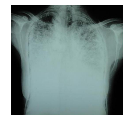
Fig. 1. Frontal chest X-ray showing reticulomicronodular opacities, with calcium density drawing the pleura and erasing the edges of the heart

ALM is a very rare condition, often asymptomatic and with a very slow evolution. Health professionals should be aware of a striking radiological appearance in contrast to poor or absent clinical signs. High-resolution CT scans and transbronchial lung biopsy are of great diagnostic value. Today, lung transplantation remains the only and last therapeutic option for this disease [14,15].