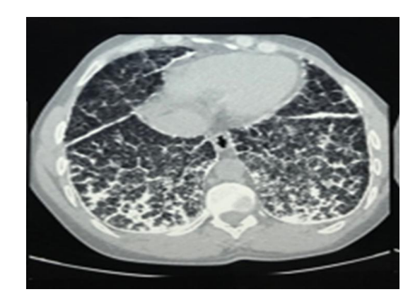
Fig. 2. Cross-sectional chest CT scan showing diffuse confluent calcified micronodules in places, predominantly at the bases with a circumferential calcified para pleural line