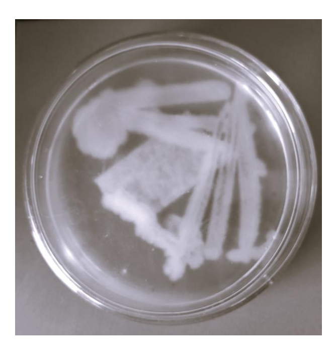
Fig. 1. Morphological characteristics of Bacillus subtilis subsp. subtilis 168 in nutrient agar medium on 24-hour incubation