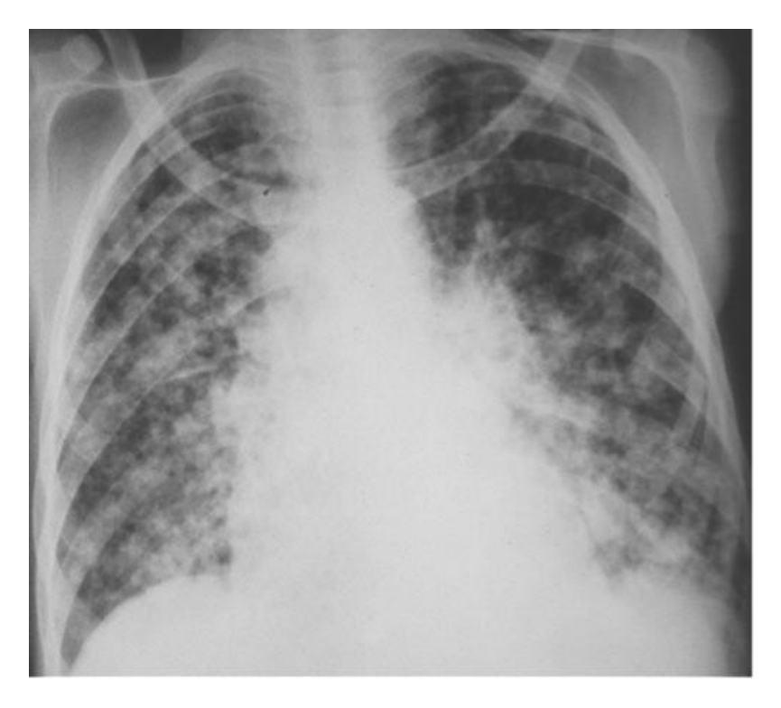
Fig. 2. PA Chest X-ray of HIV - positive PTB subject that shows bilateral diffuse reticulonodular and patchy opacities involving both lung fields

Emeka et al.; J. Adv. Med. Med. Res., vol. 36, no. 6, pp. 241-251, 2024; Article no.JAMMR.117904