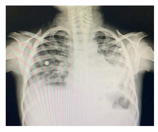
Figure 4. Chest radiography showing an increase in left lower zone infiltrates