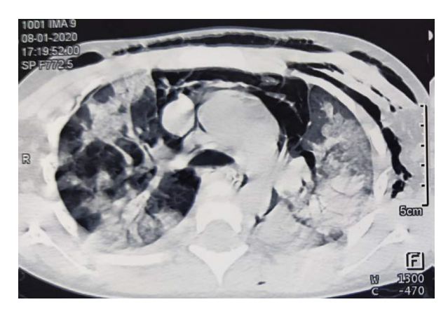
Figure 2. High resolution computed tomography of the chest showing bilateral patches of consolidation