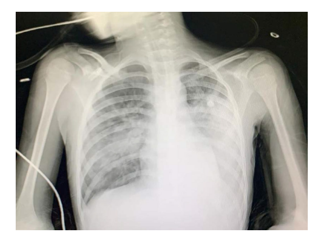
Figure 1. Chest radiography (anterior-posterior view) showing bilateral consolidation

Intercostal chest drain was inserted on the left side. The child was not relieved of fever even after three days of changing antibiotics. Blood, pleural fluid and urine cultures were sterile. Bronchial lavage revealed the growth of multidrug-resistant Acinetobacter baumannii which was sensitive to colistin, ceftriaxone EDTA sulbactum and fosfomycin. Then colistin (loading dose of 6000000 IU, then 3000000 IU every 12 hours) was started, and ceftriaxone EDTA sulbactum (1.5 mg every 12 hours) was continued. As liver functions improved, isoniazid 300mg was started and aminoglycoside stopped due to risk of significant side effects in combination with collistin. The patient became afebrile after 48 hours of revising the antibiotics. Subsequently, rifampicin was re-introduced. After two doses of rifampicin 450 mg, the boy started having bleeding through the endotracheal tube, and repeated liver functions showed deterioration (international normalized ratio — 1.8, platelet count — 110000, serum bilirubin — 2.1 mg/dL, alanine aminotransferase - 209 U/L, aspartate aminotransferase- 45 U/L). On ultrasound of the whole abdomen, hepatomegaly with minimal ascites was present. Rifampicin was stopped and fresh frozen plasma was given to control bleeding. As there was a problem with ventilation, therapeutic bronchoscopy was done to remove the clots. Bleeding tendency on re-introducing rifampicin could be due to part of sepsis