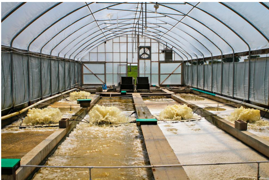
Fig. 3. Tilapia culture in raceways