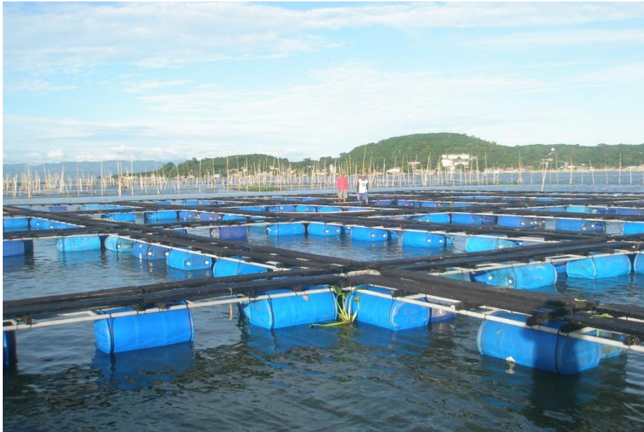
Fig. 2. Cage culture of tilapia

biofloc technology. With biofloc technology, one also needs to consider that the choice of cultivated species should take into account their capability of dealing with high suspended solid concentrations, since this negatively affects certain fish species [46].