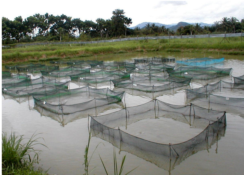
Fig. 1. Pond culture of tilapia

In Asia, the Philippines was the pioneer for cage culture in lakes and reservoirs in the region and practices semi intensive and intensive farming [36]. It was reported that, the country's cages in 2000 ha of water produced a total of 33,067mt of O. niloticus . The average yield of 540 kg/ 100m 2 cage is attained with O. niloticus (mean weight of 175g each) after 5 months of rearing fingerlings.