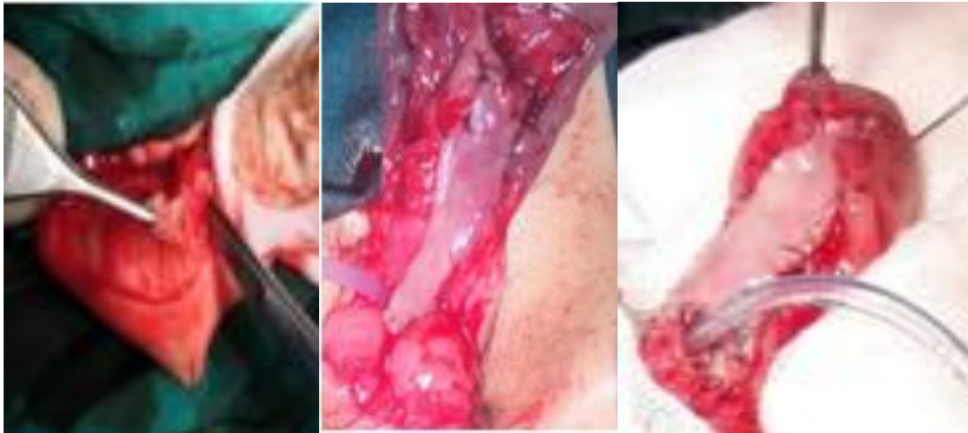
Fig. 5. Buccal mucosal graft harvesting and fixation