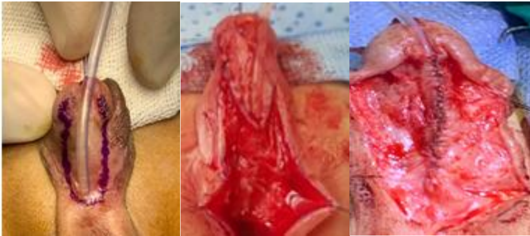
Fig. 6. Preputial graft tubularization in two layers of sutures