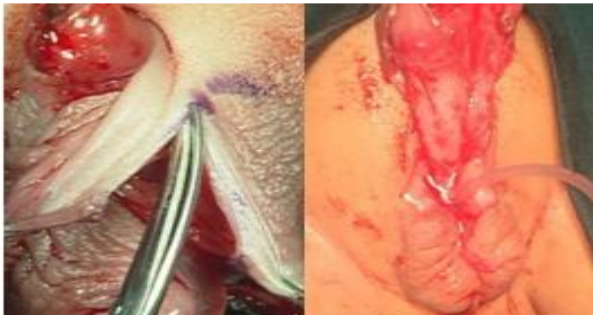
Fig. 3. Scrotoplasty for penoscrotal transposition