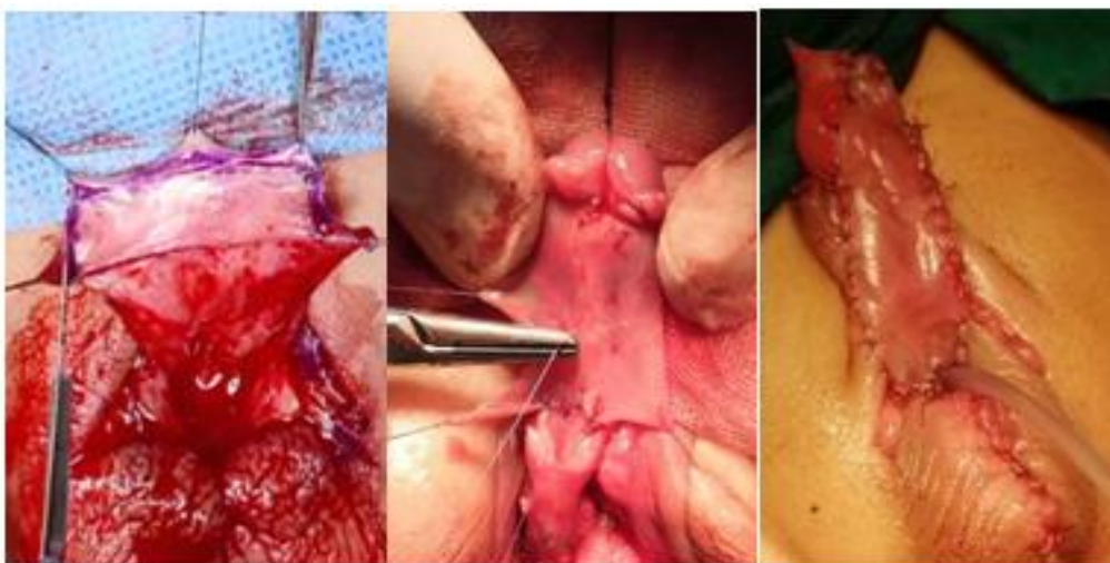
Fig. 4. Preputial graft harvesting and fixation