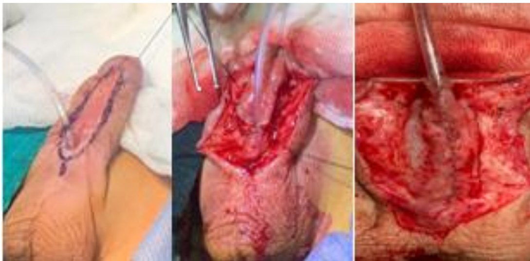
Fig. 7. Buccal graft tubularization in two layers of sutures