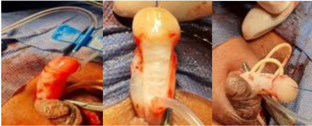
Fig. 2. Urethral plate transection, ventral corporotomies and dorsal plication of tunica albuginea