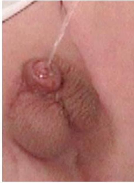
Fig. 9. Follow up of some cases with preputial graft six months postoperative