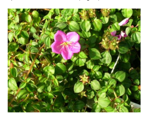
Fig. 1. The leaves and flowers of Dissotis rotundifolia (Adapted from plant breeding in the 21<sup>st</sup> century – University of Georgia)

Dissotis rotundifolia belongs to the Kingdom Plantae, the subkingdom Tracheobionta and the super division of Spermatophyta. It is in the division Magnoliophyta and belongs to the class Magnoliopsida. It is classified under the subclass Rosidae and the order Myrtales. It belongs to the family melastomataceae, the genus Dissotis and the species is rotundifolia (Fig. 1).