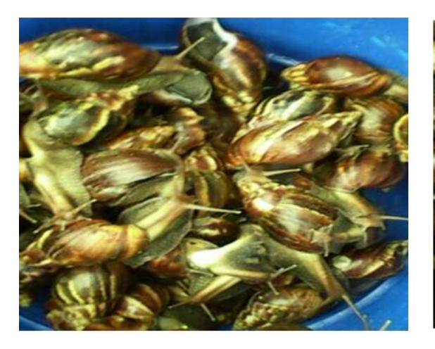
Plate 1. A. fulica

mean phenotypic traits comparison The among/within the three species of giant African land snails was carried out using 3 x 3 factorial under a Complete Randomized Design (CRD) in statistical package for Social Science (SPSS) software version 20.0. Data collected were transformed using the log transformation method in order to reduce possible biases in the measurements. Significant means were separated using Least Significant Difference (LSD) at 0.05 probability level. The data were further subjected to correlation, principal component analysis (PCA) and clustering analysis.