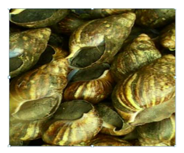
Plate 3. A. marginata