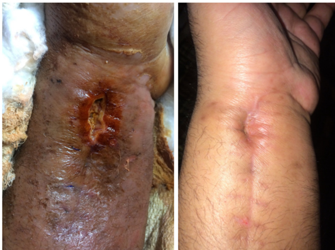
Figure 3. Two Stages of Ulcer's Evolution: Ulcer Formation (left) and Healing (right)

Ω The photographs have been consented by the patient.