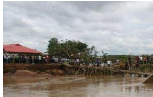
Plate 1. Flood occurrence in Apete Area in Ibadan, Oyo state