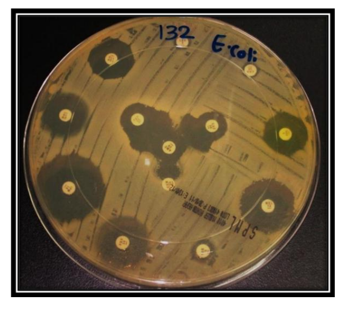
Figure 2. ESBLs producing E. coli , double disc synergy test. Showing enhanced zone of inhibition around more than one of the \beta -lactam-containing discs towards the clavulanic acid-containing disc.

*% according to total number of specified isolates; **% according to hospital wards, *** other wards such as private and isolation; ND, not detected. ESBLs: Extended spectrum-beta-lactamase.