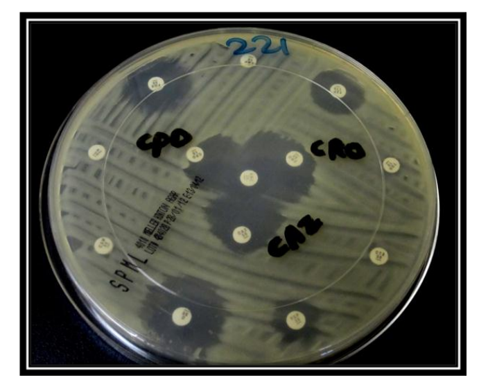
Figure 3. ESBLs producing K. pneumoniae , double disc synergy test.

were also associated most frequently with ICUs patients. Similar results were reported previously in Saudi Arabia (Asghar and Faidah, 2009; Al-Ahmady and Mohamed, 2013).