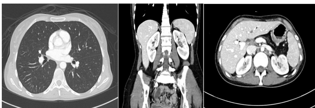
Fig. 2. CT chest and abdomen after treatment