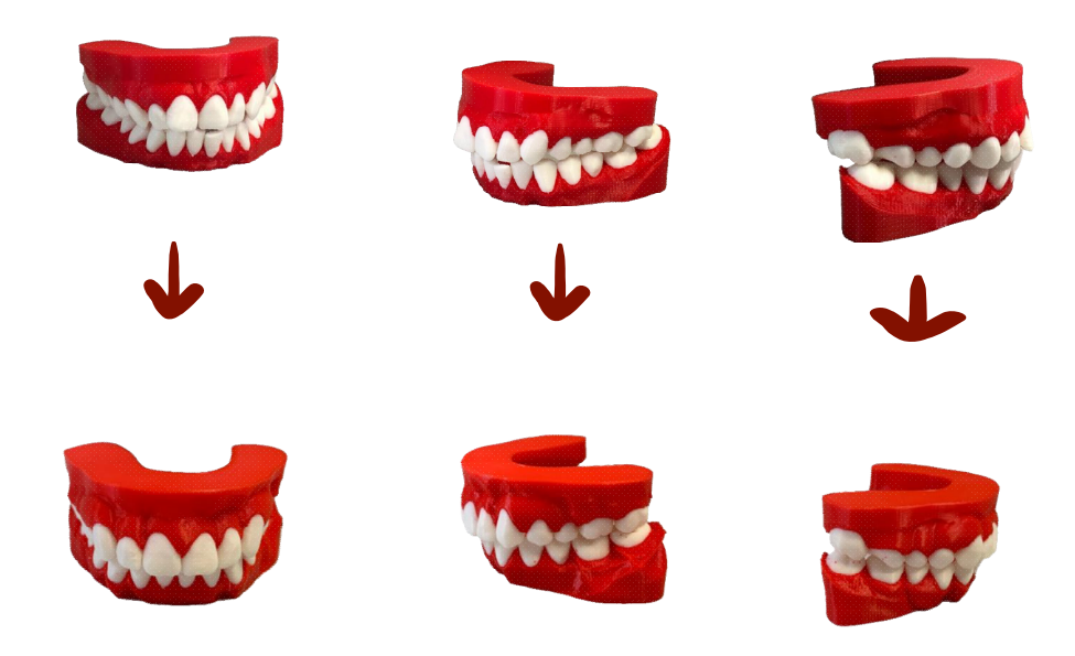
Fig. 1. Diagnostic models made using 3D printing