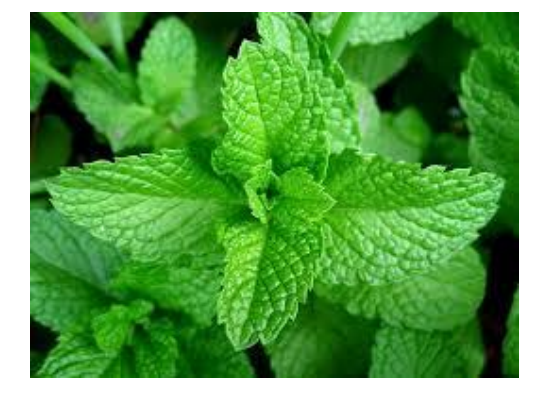
Scent leaf ( Ocimumgratissimum )

These samples were obtained at random from three different sample locations in Amassoma community. The pawpaw fruit and leaf were plucked from Pawpaw tree with a stick and scent leaf was cut with a knife. The used plants were selected because of their frequent use for nutrition and medicinal purpose by the people in the sample area. The most commonly used parts of each plant were considered as experimental target. All plant samples were washed clean using distilled water and dried under shade for accuracy of results and to avoid sample contamination. All reusable laboratory wares were washed thoroughly and rinsed with distilled water.