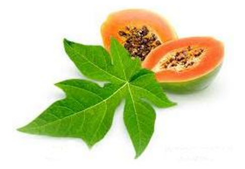
pawpaw (Carica papaya)

Samples used for this study were Scent leaf ( Ocimumgratissimum ) and pawpaw ( Carica papaya ).