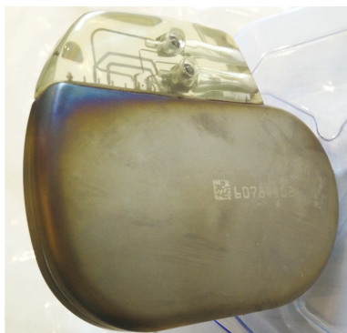
FIGURE 4: Scorched battery of the Biotronik ICD (Iforia 3 VR and Linx SD lead) due to an assumed lead insulation defect near the header.

already some months before the incident described. A significant reduction of the “first-incident-to-action time” through remote monitoring has been described by many authors [12–14]. The TRUST study demonstrated a median delay of 1 day from occurrence of the event to physician evaluation, compared to 1 month with conventional follow-up [15]. They also confirmed a cost benefit from an economical perspective. Still the need for additional manpower to analyze the huge amount of data, legal issues, and lack of standardization remain open problems [16].