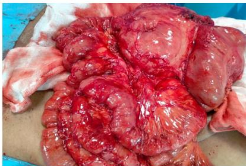
Fig. 3. Intraoperative image showing a magma of agglutinated gall bladders with fistulas (iconography of the visceral surgery department, Wing I at Ibn Rochd Hospital)