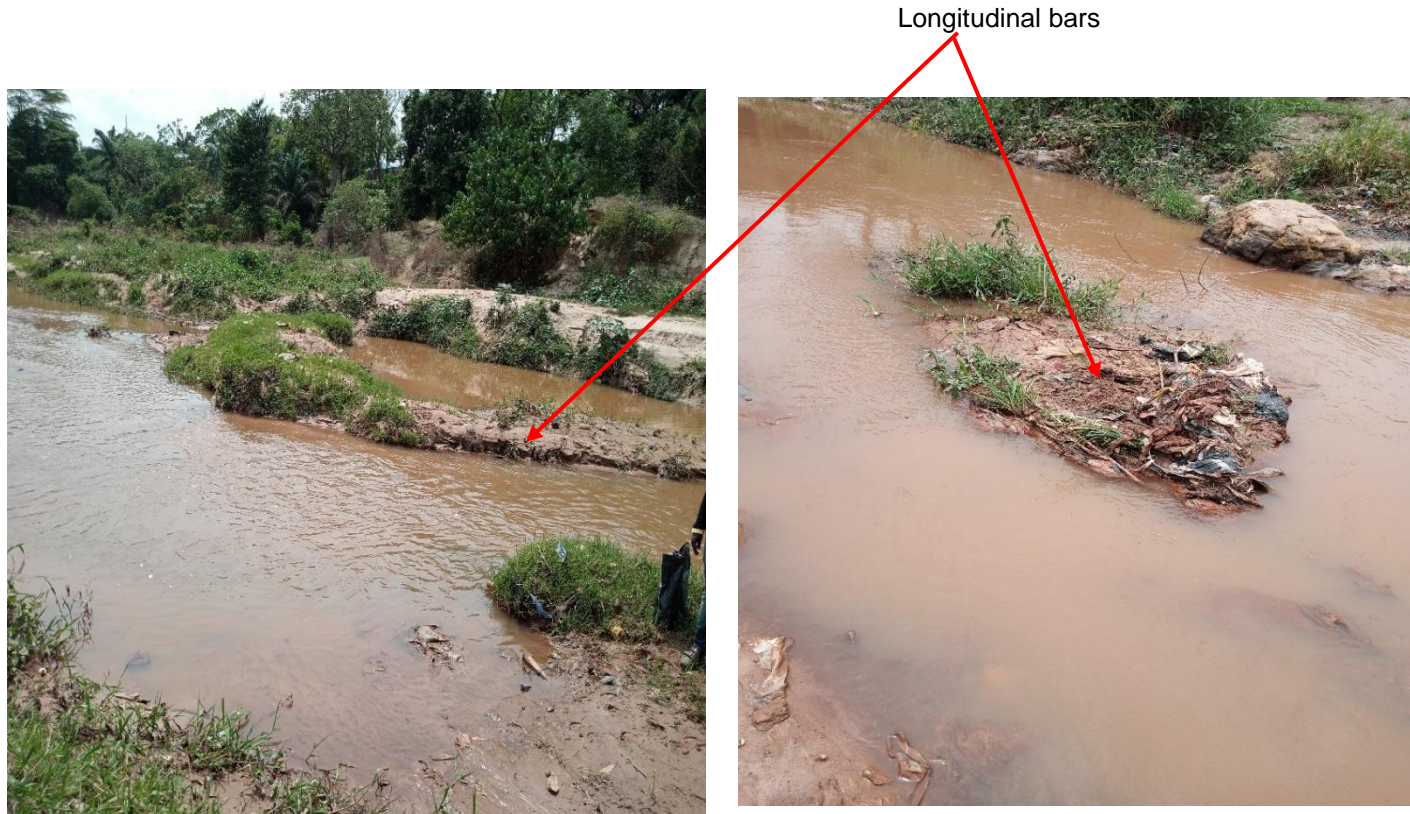
Fig. 2. Braided channels of the Ekulu River showing the longitudinal bars