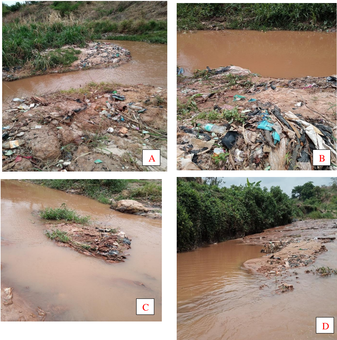
Fig. 5(a &b). Fluvial sedimentation on the outer and inner (point bars) parts of the present meander channel. The sediments are exposed due to fall in water level during dry season (c& d) Exposed braided bars sediments of the present river