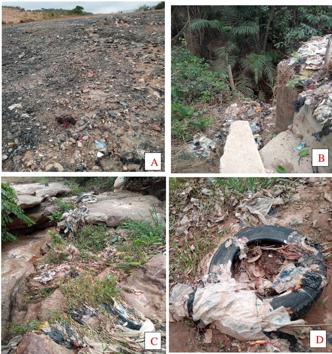
Fig. 4. On- going activities on location 1; (a) Abandoned coal mine waste dumped above the ancient and present terraces of the river that is being washed down the river channel by rain (b) Waste dump at the margin of the river also being moved down into the river channel especially during the rainy season (c &d) Exposed on- going sedimentation at the present river channel situated below the dumpsites. These sediments are exposed owing to fall in water level due to dry season