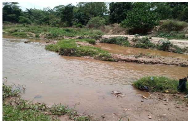
Fig. 6. Ekulu River in a less active area (below Abakpa Bridge). Nylon, plastic containers and wood debris were deposited as part of sediments on the present channels and bars of the river