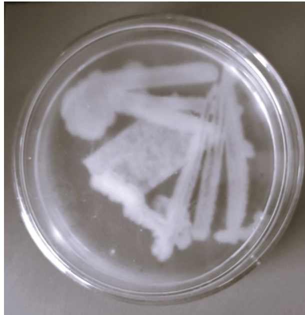
Fig. 1. Morphological characteristics of Bacillus subtilis subsp. subtilis 168 in nutrient agar medium on 24-hour incubation