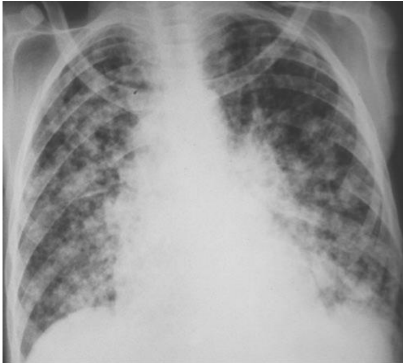
Fig. 2. PA Chest X-ray of HIV - positive PTB subject that shows bilateral diffuse reticulonodular and patchy opacities involving both lung fields

Table 1 shows that in HIV - positive PTB subjects, the majority, 137 (59.6%) were traders while 69 (30.0%) were students and 24 (10.4%) were civil servants. A total of 140 (60.9%) had secondary education while 78 (33.9%) had tertiary education and 12 (5.2%) had primary education; 139 (60.4%) were single while 91 (39.6%) were married.