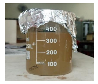
Fig. 2. Methanol extract