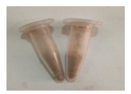
Fig. 5. Aloe vera powder