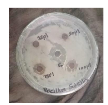
Fig. 9. Antibacterial activity of aloe vera against B. subtilis