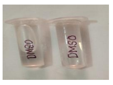
Fig. 6. DMSO