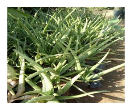
Fig. 1. Aloe vera sample