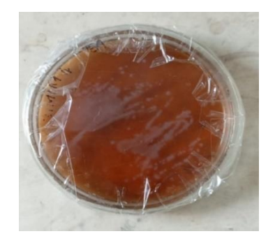
Fig. 3. B. subtilis