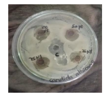
Fig. 8. Antifungal activity of aloe vera against C. albicans