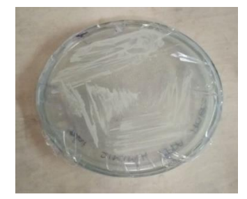
Fig. 4. C. albicans