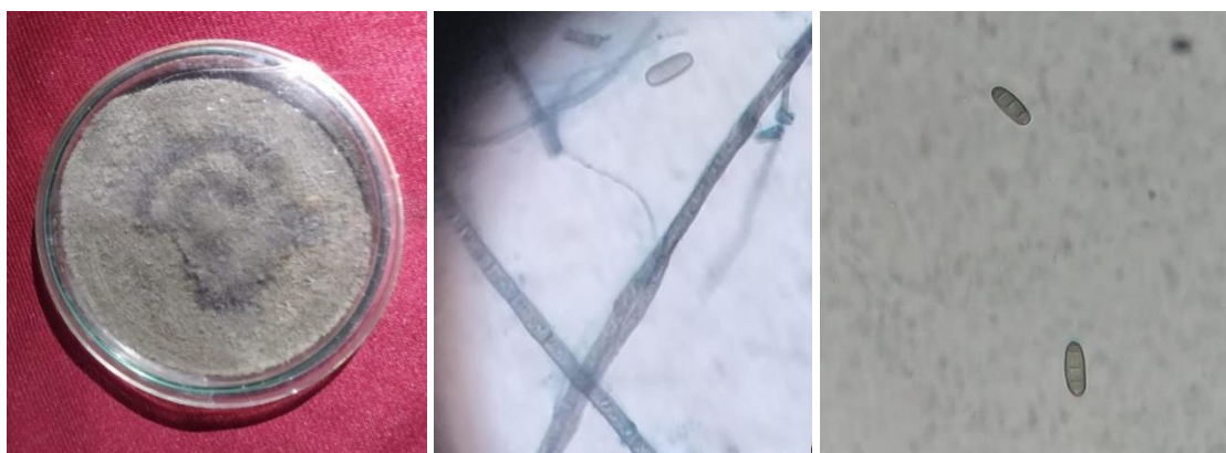
Plate 2. Growth of Bipolaris oryzae in petri-plate, its hypal growth and spores