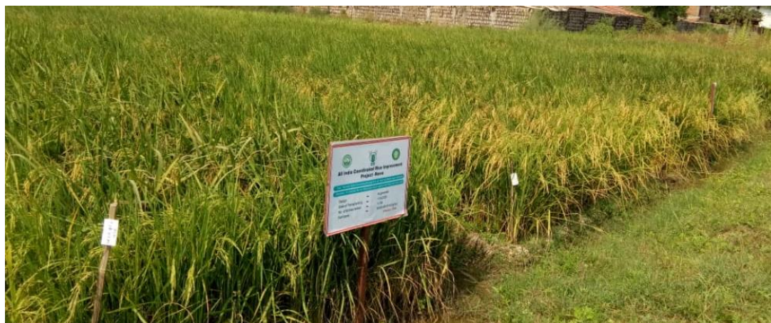
Plate 1. A view of field experiment

Design : RBD Replication : 3 Treatments : 6 Variety : PS-4 (Highly Susceptible to Brown spot disease) Layout : 4x3 m 2