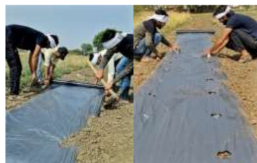
Traditional mulching (Laying, Covering & Punching separately)