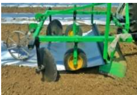
Developed Mulching Machine (All operation in a single pass)

Experimental trails were taken under field of department of farm machinery and power engineering, college of agricultural engineering, JNKVV, Jabalpur. Operational view of low cost tractor operated plastic mulch laying machine and traditional method of mulching under actual field condition are shown in Fig. 2. Also, the views of plastic sheet lay by developed mulching machine and traditional method of mulching are shown in Fig. 3.