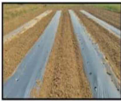
Developed Mulching Machine