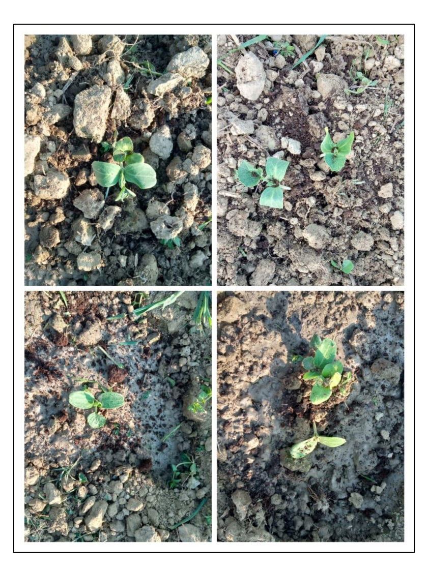
Fig. 3. Damage by red pumpkin beetle at seedling stage