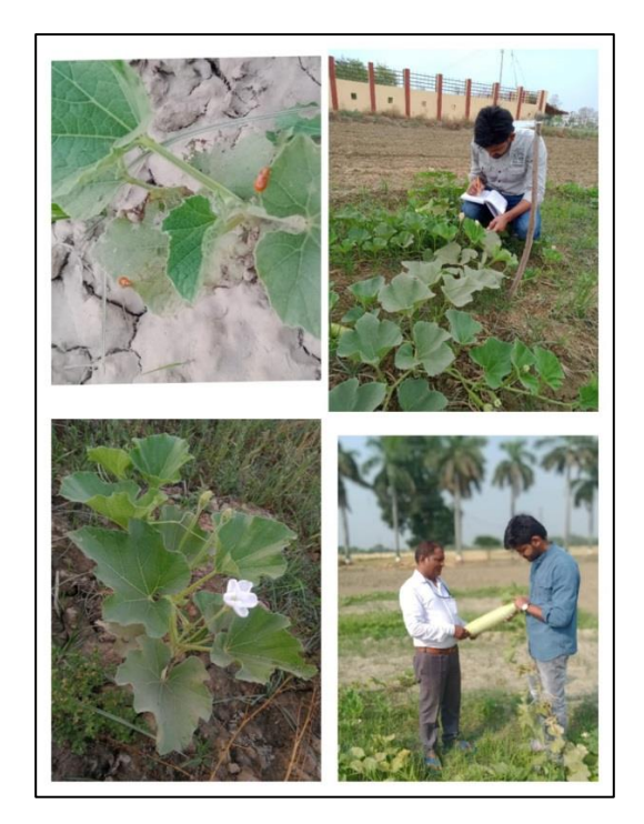
Fig. 2. Observation recoded