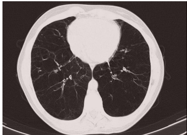
Figure 1. Results of computed tomography scan of the patient's chest from the qualification day for lung transplantation — multiple emphysematous bullae

In 2014, she was admitted to the Silesian Center for Heart Diseases for preliminary qualification to lung transplantation. Alpha 1-antitrypsin deficiency and connective tissue diseases were excluded. Echocardiography did not reveal any abnormalities and did not indicate the presence of pulmonary hypertension (right ventricle systolic pressure = 25 mm Hg, acceleration time = 143 ms, tricuspid annular plane systolic excursion = 21 mm, left ventricle ejection fraction = 55%). During the six-minute walk test (6MWT), the patient reached the distance of 356 m with 2 points in the Borg scale and 8% of desaturation during the test. After 11 months, a decision of the