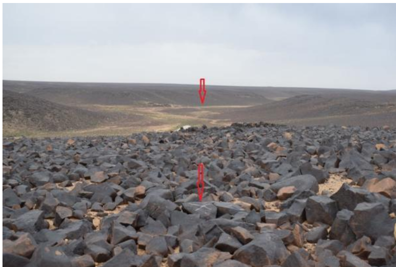
Figure 16. A photograph showing the sites where the inscriptions were recorded and showing the nearby valley.

The author of the inscription indicates that he pastured the valley, which appears in the Figure 16. The author tries to stress on the significance of the act he did by residing and grazing his herd animals in this valley. This inscription was discovered on one of the rocks of a cairn that overlooks the valley. It appears that the author wrote this inscription during grazing his animals in that valley.