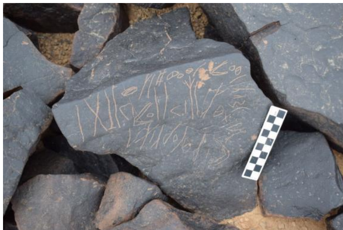
Figure 15. Stone 12 (Photograph: A. Al-Manaser).

Knowing the location where the inscription was discovered and linking it directly with the interpretation of the inscription clearly contributes to a clearer understanding of the message or information that the inscription wanted to communicate to the one who will read the inscription after him. In Safaitic inscriptions, the authors tried to convey a specific picture to who will come after them about their emotions, the events they came across, the way of their life, the way they spend their time. Therefore, it is important for scholars who discover such inscriptions to report a complete picture of location of the inscription because the author might have wanted to deliver specific information through the place where he wrote his inscription.