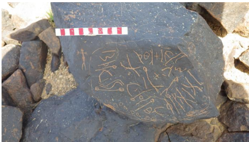
Figure 13. Stone 11

This inscription was engraved on all sides of the stone. There is also a drawing of a camel accompanying this inscription. The inscription revealed that the author camped there after travelling to a watering-place from the inner desert and so he requested from the deity Lt to grant security and to inflict harm, dumbness, blindness, and mange on whoever scratches out the inscription (see C 2779; WH 368; RSIS 351). For ‘my we have compared Arabic ‘aman (maṣdar of ‘amiya “to be blind in both eyes”, Lane 2160c), for grb we have compared Arabic ḡarab “mange, scab” or “disease upon the eyelids” (Lane 403a).