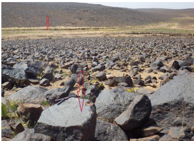
Figure 14. A photograph showing the sites where the inscriptions were recorded and showing the nearby valley (Photograph: A. Al-Manaser).

"This is the temple which was built by rwḥw , son of mlkw , son of ' klbw , son of rwḥw , for Allat their goddess who is at Salkhad, and which was founded by rwḥw , son of qsyw , great grandfather of this rwḥw mentioned above. In the month of Ab, in the seventeenth year of Malichus, king of the Nabataeans, son of Aretas, king of the Nabataeans, who loves his people" (Alpass 2011: 234). 4