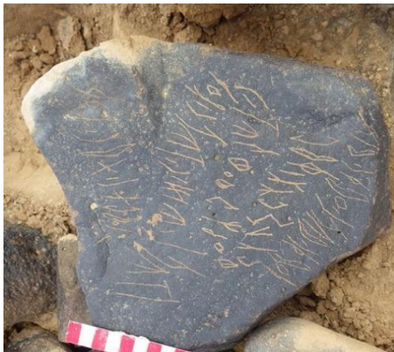
Figure 9. Stone 7.