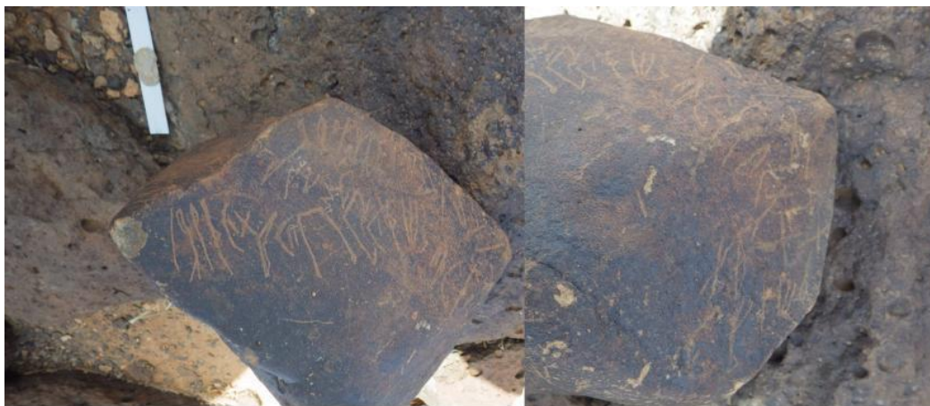
Figure 7. Stone 5 (Photograph: A. Al-Manaser).

This inscription was engraved on a basalt stone, and it is clear that many of its letters have been damaged. This is likely because the stone was transferred from its original location to be used in a cairn; where it was positioned face-down. The transliteration of this inscription was based those letters which have been preserved, and our familiarity with the Safaitic words and the commonly used phrases. It appears that the author of this inscription fed [his animals] on dry fodder. It is worth noting that the author did not specify what types of animals he possessed. It could have been sheep, goats, or camels....etc. It is a common for the authors of the Safaitic inscriptions not to specify the type of animals when using the verb «lf «to feed on dry fodder» on dry fodder (C 3933; SIT 12; AbHYN 1; AAEK 67). The author also asked the deities Lt and Ḍs ṯ to grant him security and safety and to harm whoever scratches out the inscription.