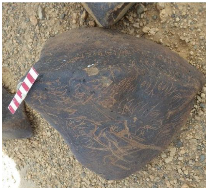
Figure 12. Stone 10 (Photograph: A. Al-Manaser).