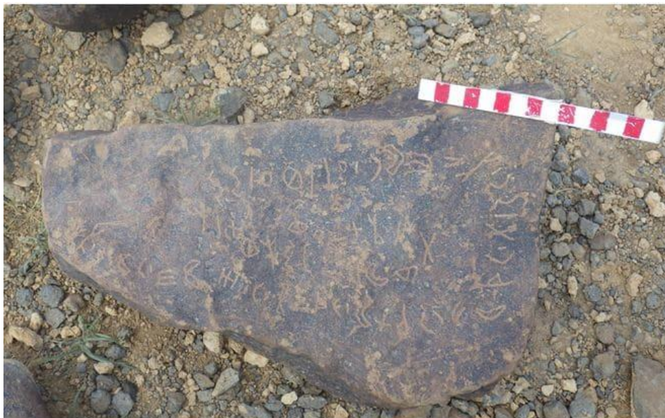
Figure 6. Stone 4.