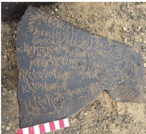
Figure 10. Stone 8 (Photograph: A. Al-Manaser).