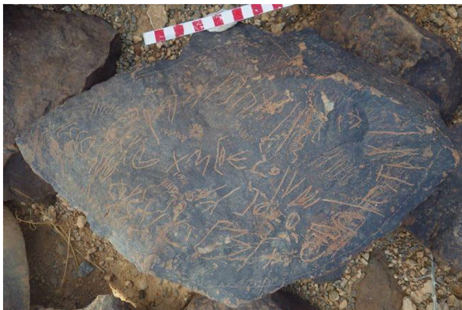
Figure 5. Stone 3.

inscription within the frame. There is also another inscription below this one. The author dated his inscription to the year of 'bdt who could have been a famous person or a regular person but relevant to the author. In this regard, there is another Safaitic inscription dated to reign of Nabataean king Obadat (ANKS 1). The author also requested from (prayed for) the deity Lt to grant security and safety, and requested from the deity Yt' to grant peace and inflict harm on whoever scratches out the inscription whether being a human or a herd animal. It is noteworthy to mention that the phrase 'ns' w n'm was mentioned in another Safaitic inscription (KRS 1179). It is also possible that this phrase refers to personal names as it is difficult to interpret n'm as a herd of animals.