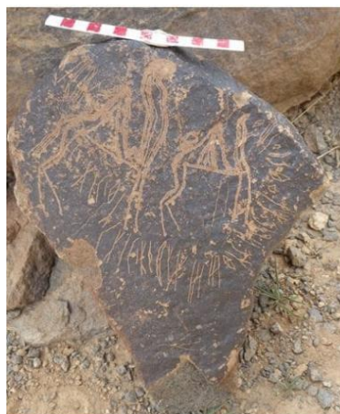
Figure 3. Stone 1.