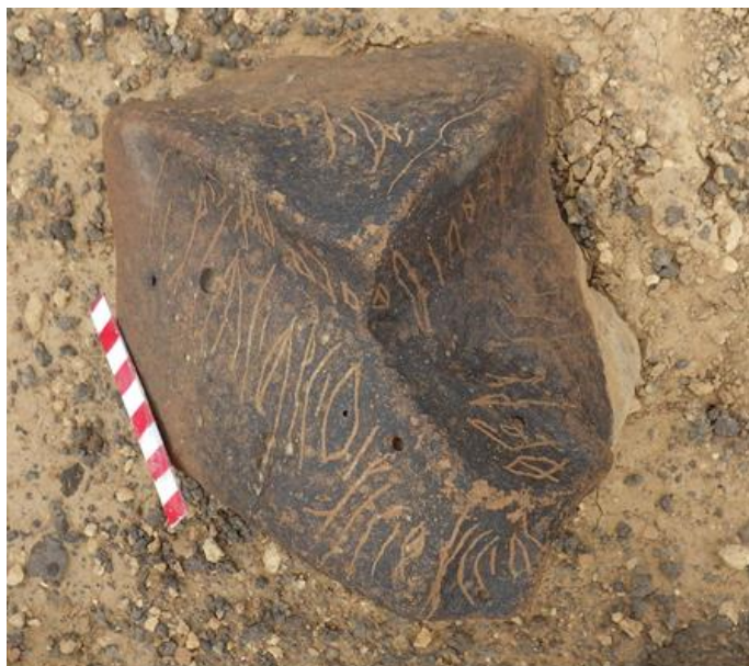
Figure 11. Stone 9 (Photograph: A. Al-Manaser).

By 's'lm son of Rs 2 h son of Šbh son of Hy son of Gn'l son of Whb son of S'b and he found the traces of Ġt and he grieved in pain