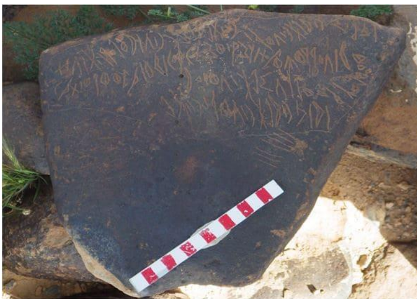
Figure 4. Stone 2.

The basalt stone, on which this inscription was engraved, has been subject to some fracture as shown in the picture of this stone. The inscription is carved round drawings of a male and female camel apparently with rich trappings. It appears that the drawing of the she-camel and the male camel had been made before the inscription was engraved as the letters of the inscription are encircling the drawing. All the letters of the inscription are clear and easy to read apart from the last two letters. However, it has been possible to figure out these two letters by comparison with the other similar inscriptions. After stating his genealogy, the author mentioned that the beautiful drawing of the camel on the stone, then he requested from the deity Rḍy to inflict baldness on whoever scratches out the inscription. For qr' we have compared Arabic qara 'u ar-Rāsi which is known to translate to “to completely lose hair on the head”. It is also defined in some sources as “to lose hair as a result of a disease” (Ibn Manzūr 3594). The last word in the inscription can be compared to inscription AMSI 131 and, thus, can be translated to mean ‘stone’.