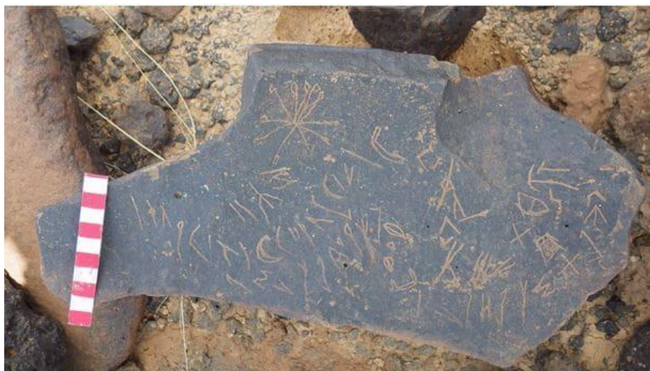
Figure 8. Stone 6.

This inscription was engraved on multiple sides of a basalt stone. All the letters are well-preserved and can be easily read. On one of its sides, there is a drawing of a female camel. It appears that the author went to the gb ʔt area with his herd, and he waited there for abundant rain to come. The word gb ʔt is commonly used by the inhabitants of the Jordan Badia to refer to a rocky area with cavities where water collects. The word gb ʔt could be compared with Arabic ḡiba ʔah the plural of ḡab ʔ «a hollow or cavity in a mountain where water of the rain stagnates or collects» (Lane 372c). The Badia Epigraphic Survey team noticed, during the field surveys, that the areas close the gb ʔt area are generally characterized by an abundance of rock art drawings and Islamic-Arabic inscriptions, in addition to the presence of some Islamic mosques (Al-Manaser and Ellis 2018: 72). This is likely due to the stagnation of water in these areas for at least three months, and thus they are more attractive for longer residence for the Bedouins than the dry areas in the desert. By the end of the inscription, the author requested from Lt to grant security and inflict harm on whoever scratches out this inscription 3 .