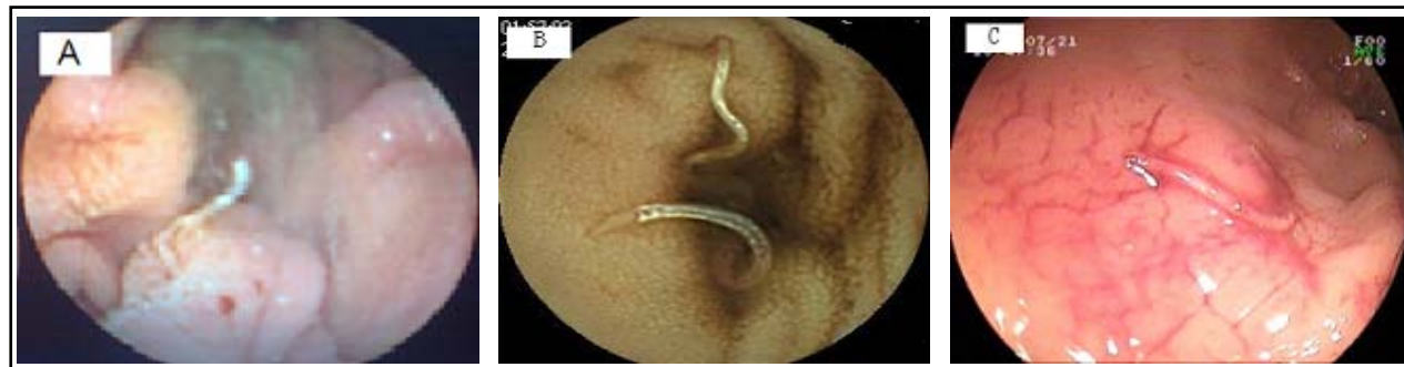
Fig.1: (A). Image of a suspected arteriovenous malformation as seen on capsule endoscopy in the proximal jejunum in a 36 years old male patient with obscure bleeding, which was revealed AVM by Double-balloon enteroscopy. (B). Image of two hookworms as seen on capsule endoscopy in the distal ileum in a 55 years old female patient with unknown anemia, and (C). Double-balloon enteroscopy finding of many hookworms in the ileum in the same patient.

Findings on double-balloon enteroscopy following capsule endoscopy: The DBE procedures were performed successfully in 62 patients (Table-II), antegrade DBE was performed in 36 patients, retrograde in 20, and combined antegrade and retrograde in 6 (total of 68 DBEs), all after CE (Fig.2). The mean duration of DBE was 80 minutes (range 50 to 180 minutes). The overall detection rate of small bowel disease with CE+DBE was (77.4%, 48/62), Fluoroscopy was used during the DBE procedures. Forty-two procedures were performed under general anesthesia and 26 procedures were