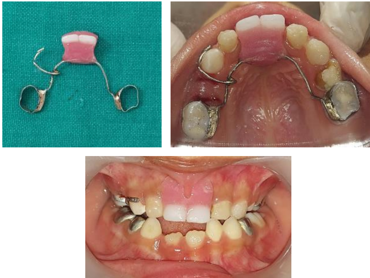
Fig. 6. Fabrication and insertion of modified groper's appliance with canine hook IRT 53