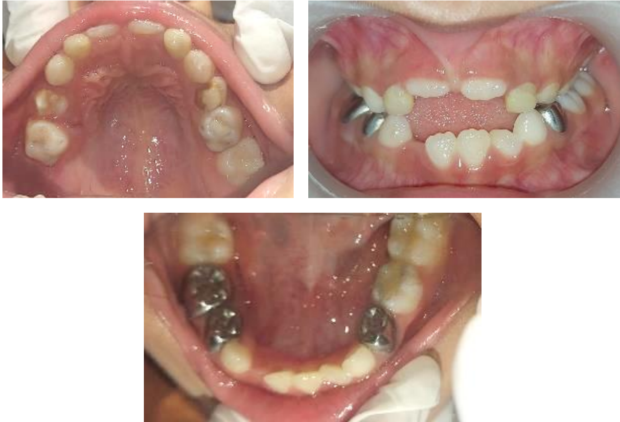
Fig. 7. Post operative after 18 months follow up