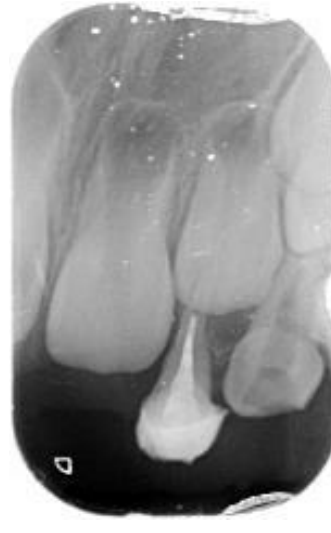
Fig. 5. Pulpotomy followed by post & core build up IRT 52, 62