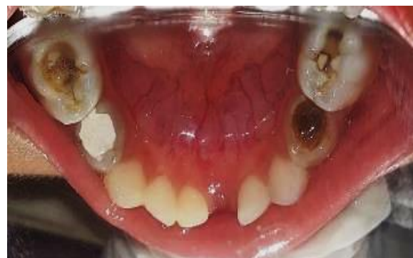
Fig. 1. Pre-operative clinical images