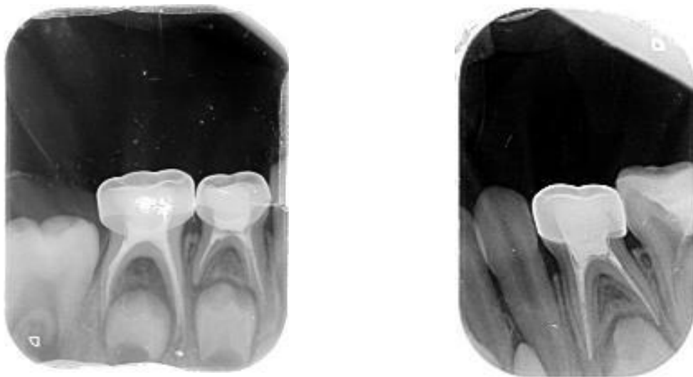
Fig. 3. Pulpectomy followed b y full coverage restorations IRT 74, 84, 85