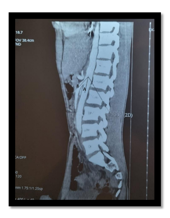
Fig. 4. Sagittal section abdomino-pelvic CT scan before and after contrast material injection; A) angulation between abdominal aorta and superior mesenteric artery; B) measured at 30°, fulfilling the diagnostic criteria for NCA

Its pathophysiology remains unknown but several hypotheses have been put forward: anatomical variants [13,14]; duplicity of the left renal vein, in which case patients may suffer from both anterior and posterior components; ectopic or horseshoe kidnevs: abnormal congenital birth of the spermatic and ovarian arteries may also constrict the renal vein; with cofactors: hypertension of the venous network (vena cava more than portal) may contribute to the increase or appearance of signs [15] the female predominance of the syndrome in adults could be explained by valvular alteration of the gonadal veins following venous hypertensions during pregnancy [15]; only one case of aortic aneurysm below the SMA (superior mesenteric artery ) has been revealed because it induced a nutcracker syndrome. In contrast, all causes of extrinsic renal vein compression can induce secondary nutcracker pancreatic syndromes. including cancers, retroperitoneal tumors. and para-aortic adenopathies [14].