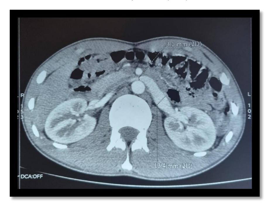
Fig. 3. Axial section abdomino-pelvic CT scan before and after contrast material injection, beak sign (arrow) designating at the level of the aorto-mesenteric fork

[10,11], "other etiologies: Pancreatic tumors, para-aortic adenopathies, retroperitoneal tumors, abdominal aortic aneurysm, duplication of the left