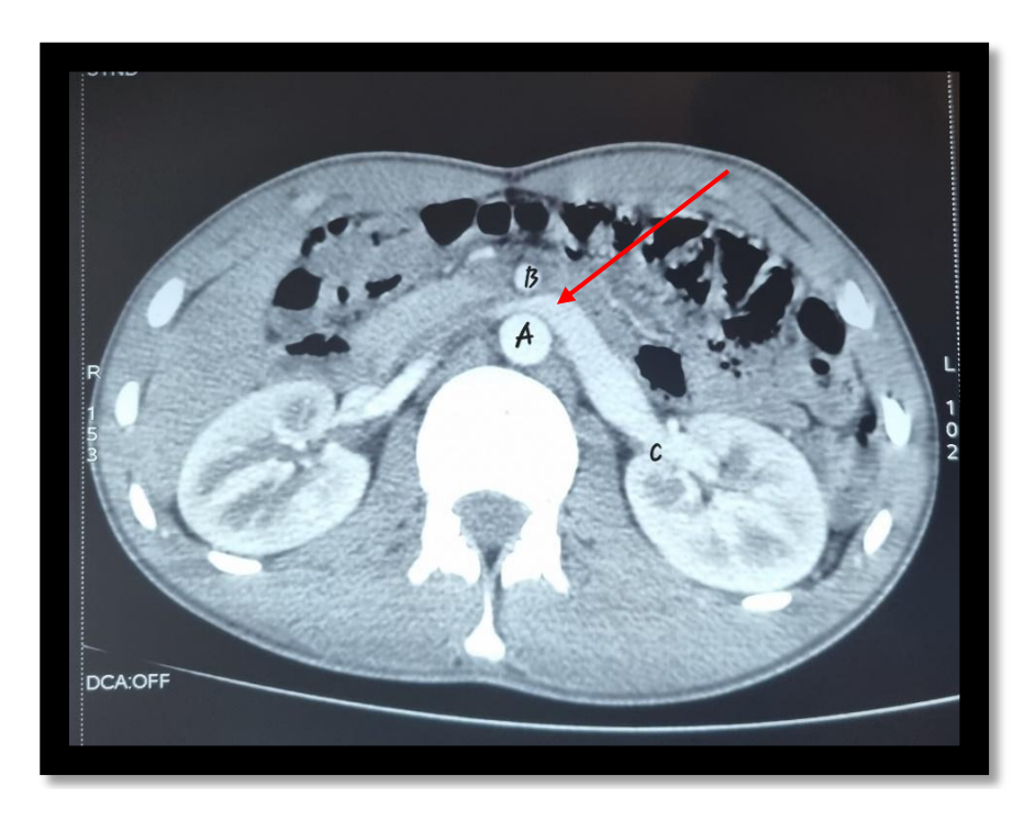
Fig. 2. Axial section abdomino-pelvic CT scan before and after contrast material injection, beak sign (arrow) designating at the level of the aorto-mesenteric fork; A) abdominal aorta; B) superior mesenteric artery; C) compression of the left renal vein; ratio of hilar and aorto-mesenteric portion of the left renal vein diameter (>2.25), fulfilling the diagnostic criteria of Nutcracker syndrome (NCA)