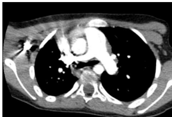
Fig. 5. CT thorax showing dilated main pulmonary (asterisk) with normal looking left pulmonary artery, and hypoplastic right pulmonary artery