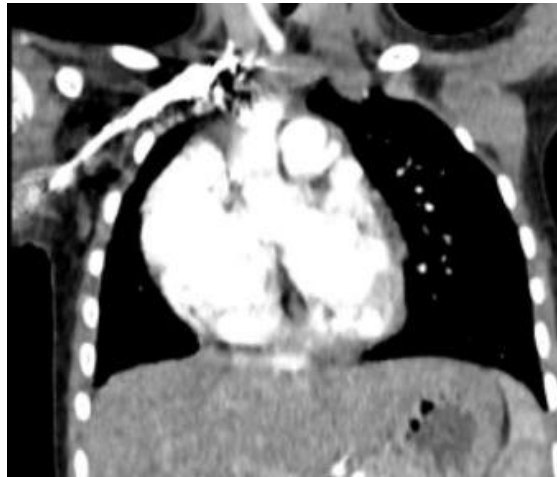
Fig. 4. Coronal CT reconstruction showing dextrocardia