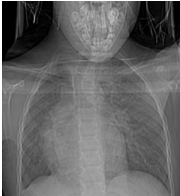
Fig. 1. Chest radiograph showing right postero-basal pulmonary opacity and cardiomegaly

Sagittal reconstruction of the CT study (Fig. 3) showed typical scimitar-shaped structure.