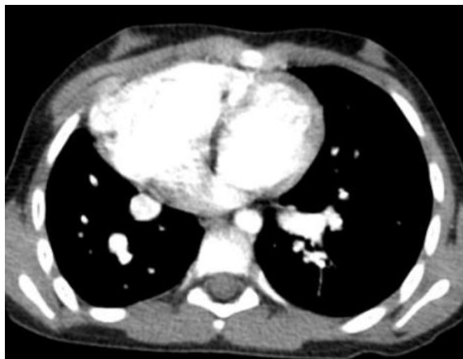
Fig. 2. Axial computed tomography section, after injection of contrast medium showing a single right pulmonary vein that drains into the right atrium