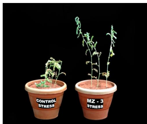
Fig. 3. Thirty days old chickpea seedlings under drought stress conditions

conditions and drought stress (Table 4). Drought stress condition decrease the chlorophyll content of leaves of both inoculated and uninoculated seedlings compared to seedling (inoculated and uninoculated) at ambient conditions. A. larrymoorei strain MZ 3-ABF inoculation counteracted the adverse effect of drought on leaf chlorophyll compared to uninoculated control. A significant decrease in the protein and sugar content of uninoculated seedlings was observed on exposure to drought stress, whereas the protein (1.26-fold) and sugar (1.29-fold) content of inoculated seedlings significantly increased on exposure to drought stress