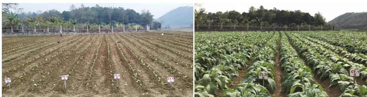
Fig. 2. Newly planted experimental FCT (left) and after finishing lay-by (right); Signboard: CT1 - CT5 corresponds to treatments (1) - (5); Roman numerals for repetitions