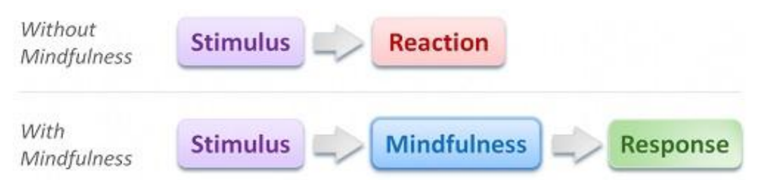
Fig. 1. Mindfulness to promote positive relationship among the people (Sourced: Adopted from Mental Health Foundation [8], New Zealand).

Among numerous benefits, one of the major contributions of mindfulness is to promote positive relationships among people as shown in Fig. 1.