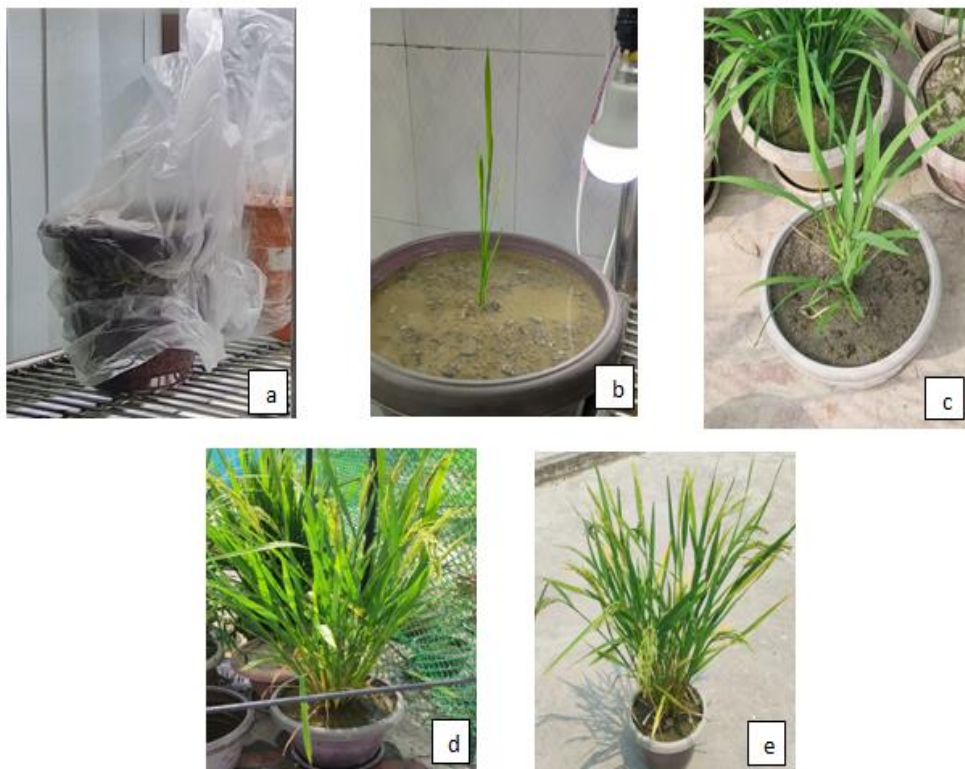
Fig. 3. a. Plantlets cover with polybags, b. Plantlet grown in vermiculite, c. Plantlets in soil at vegetative stage, d. Plants at reproductive stage, e. Mature plants obtained from tissue culture

We had continued with RM-AC-2 because the regeneration of the genotype of RM-AC-2 was successful. Effective tiller per hill, Plant height, Panicle length, grain per panicle, filled grain per panicle, grain length/breadth and hundred seed weight was recorded 32, 85.7 cm, 21.3 cm, 144.37, 118.3, 3.32 and 2.45 respectively (Table 3).