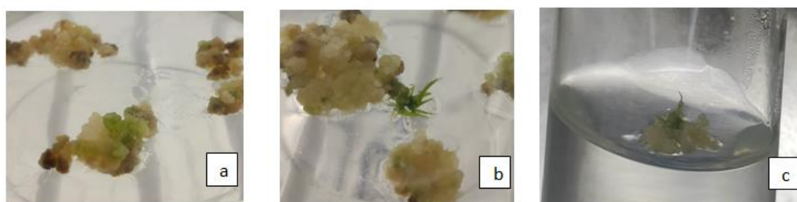
Fig. 2. a. Regenerated calli in regeneration media, b. Plantlet in regeneration media, c. Plantlet obtained from tissue in rooting media